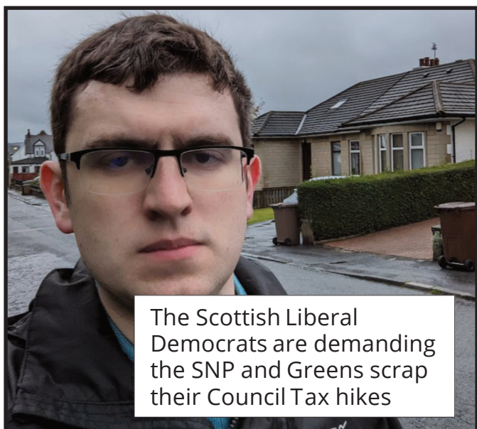
The Scottish Liberal Democrats are demanding the SNP and Greens scrap their Council Tax hikes