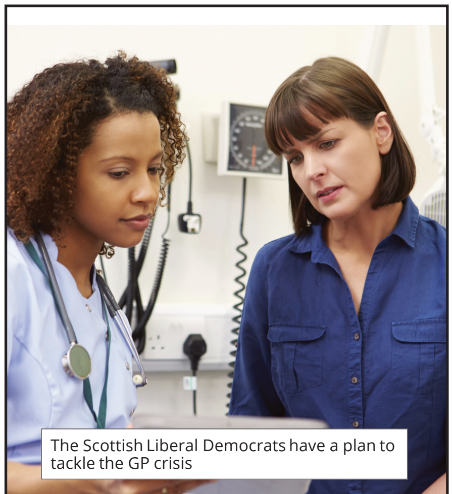
The Scottish Liberal Democrats have a plan to tackle the GP crisis

"The Scottish Lib Dems will be part of that change. We will make sure it is a priority for people to be able to see a GP when they need to and tackle the crisis in our healthcare."